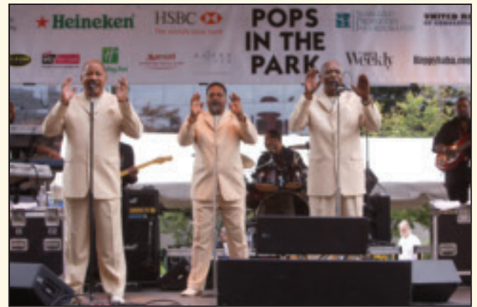
The Stylistics at Pops in the Park